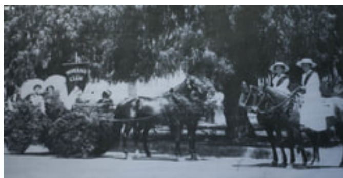
The Woman's Club float with horsewomen in the 1908 Tilting Tournament & Floral Parade.

This year's Area C conference was special because it included something we don't often see—a club joining the Federation. Or as in this case, rejoining the Federation.